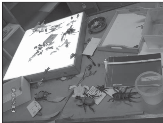
Light box and magnifying glasses stimulate thinking.