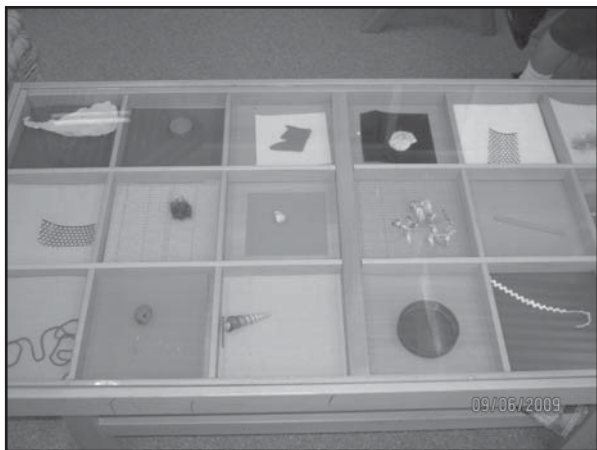
Colour and visual stimulus.