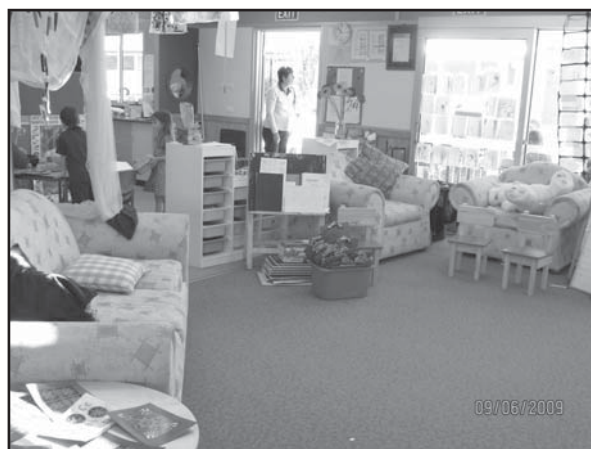
Furniture donated by families.